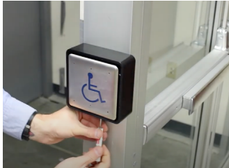
Secure Locking Screw