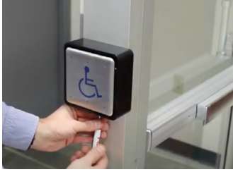
Unscrew Locking Screw