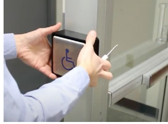
Slide Box Upward