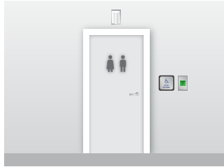
Single Occupancy Restroom