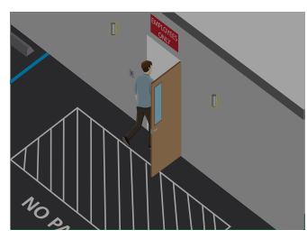
Day / Night Mode