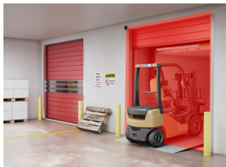
Industrial Roll-up Door