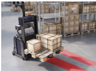
Driverless Fork Truck