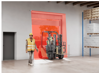
Small, High-Performance Doors