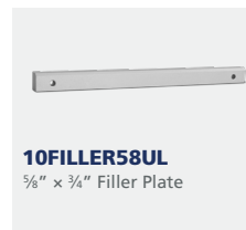
10FILLER58UL ⅝" x ¾" Filler Plate