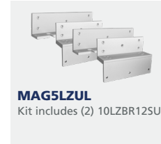
MAG5LZUL Kit includes (2) 10LZBR12SUL