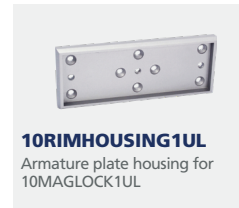
10RIMHOUSING1UL Armature plate housing for 10MAGLOCK1UL