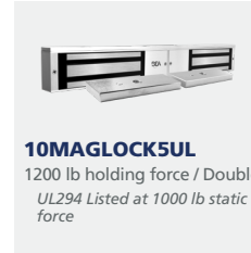
10MAGLOCK5UL 1200 lb holding force / Double UL294 Listed at 1000 lb static force