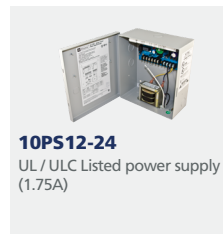
10PS12-24 UL / ULC Listed power supply (1.75A)