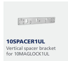
10SPACER1UL Vertical spacer bracket for 10MAGLOCK1UL