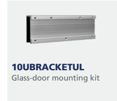
10UBRACKETUL Glass-door mounting kit