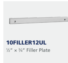
10FILLER12UL ½" x ¾" Filler Plate