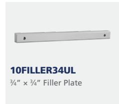
10FILLER34UL ¾" x ¾" Filler Plate