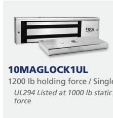
10MAGLOCK1UL 1200 lb holding force / Single UL294 Listed at 1000 lb static force