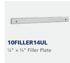
10FILLER14UL ¼" x ¾" Filler Plate