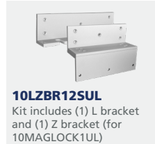
10LZBR12SUL Kit includes (1) L bracket and (1) Z bracket (for 10MAGLOCK1UL)