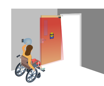
Low Energy Swing Doors